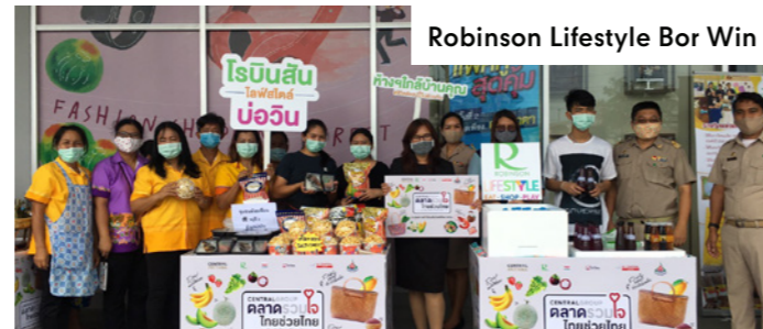
Robinson Lifestyle Bor Win