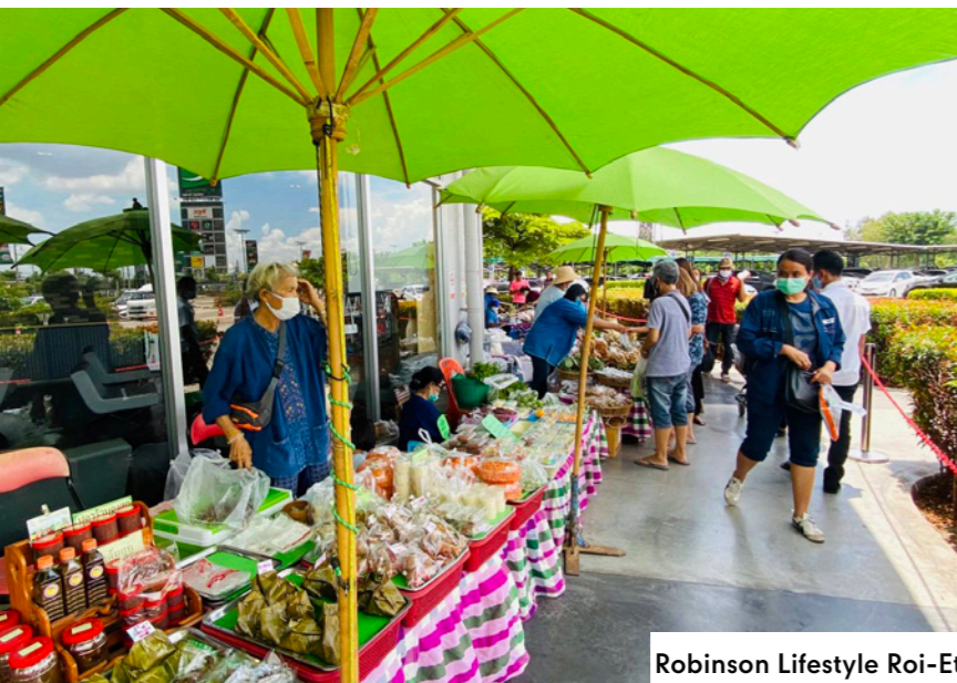
Robinson Lifestyle Roi-Et