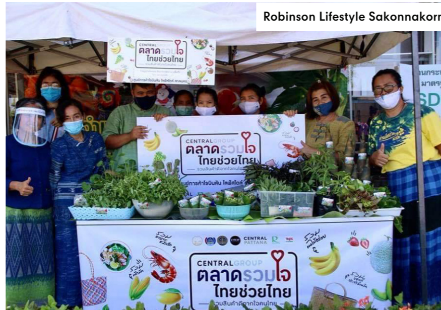
Robinson Lifestyle Sakonnakorn